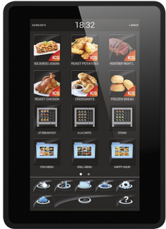
LCD 10" Touch Screen